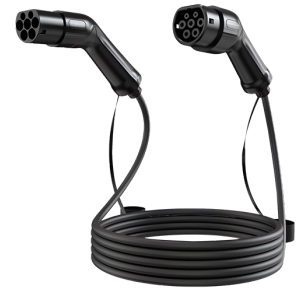
Charging cable 7kW/22kW

Household plug (Type E/F, Type G, Type L)