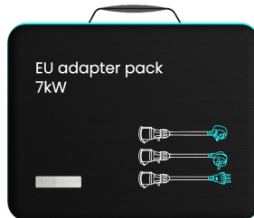
EU adapter pack 7kW

CEE 16A, CEE 32A, household plug (Type E/F, Type G, Type L)