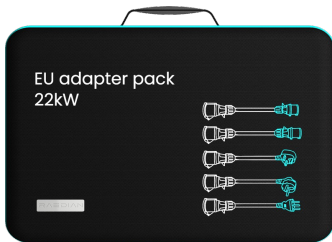
EU adapter pack 22kW

CEE 16A, CEE 32A, household plug (Type E/F, Type G, Type L)