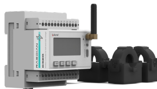
Air DLM kit

Wireless controller for dynamic load balancing and solar charging