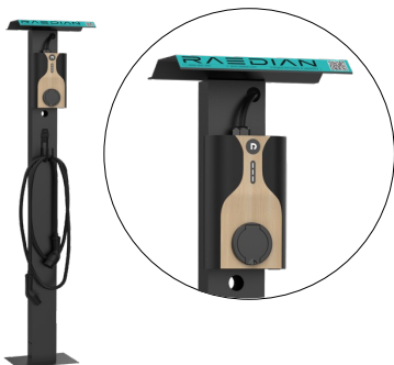
Pedestal with roof

5m/7,5m, Type 2 to Type 2 Comes with a carry bag